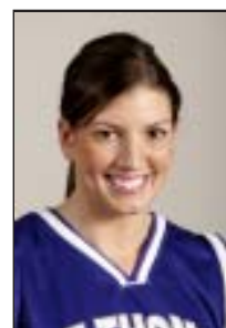
Erica Opdahl Senior Center