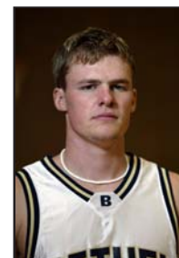
Isaac Hinrichs Senior Center